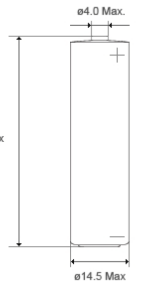
Dimensions in mm